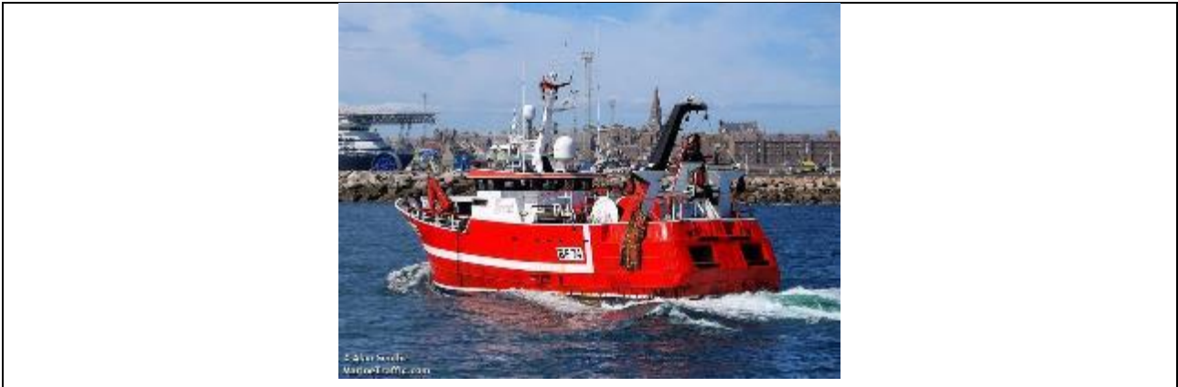
Table 5 - Tranquillity S Guard Vessel Details