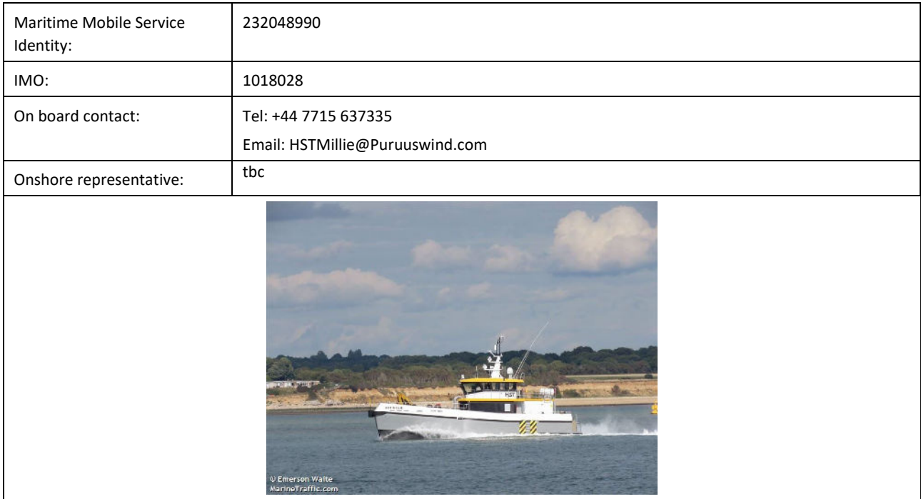
Table 8 – Farra Ciara Vessel Details