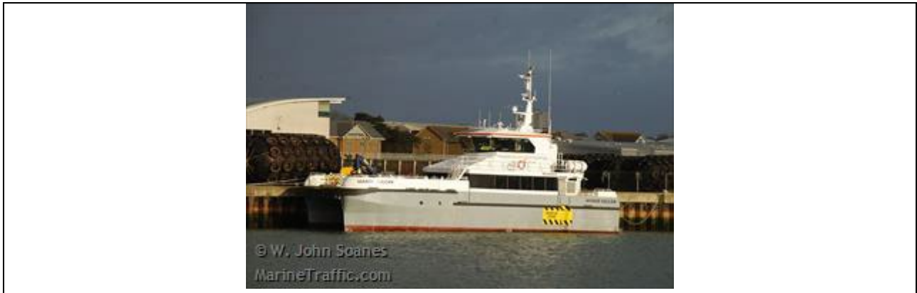
Table 6- Green Storm Vessel Details