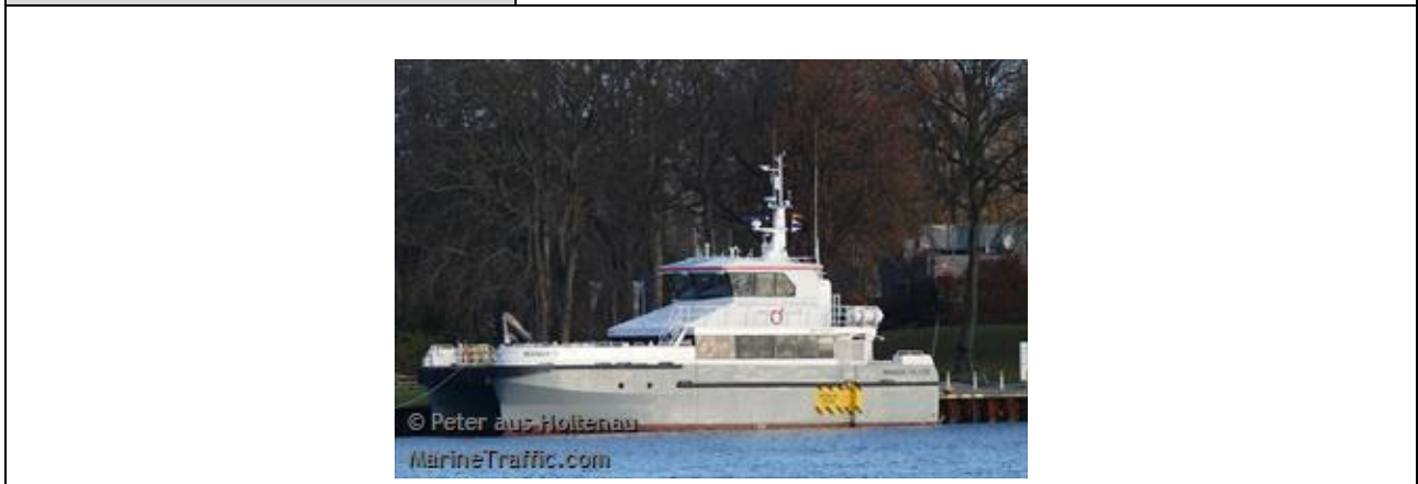
Table 5 – Manor Vulcan Vessel Details