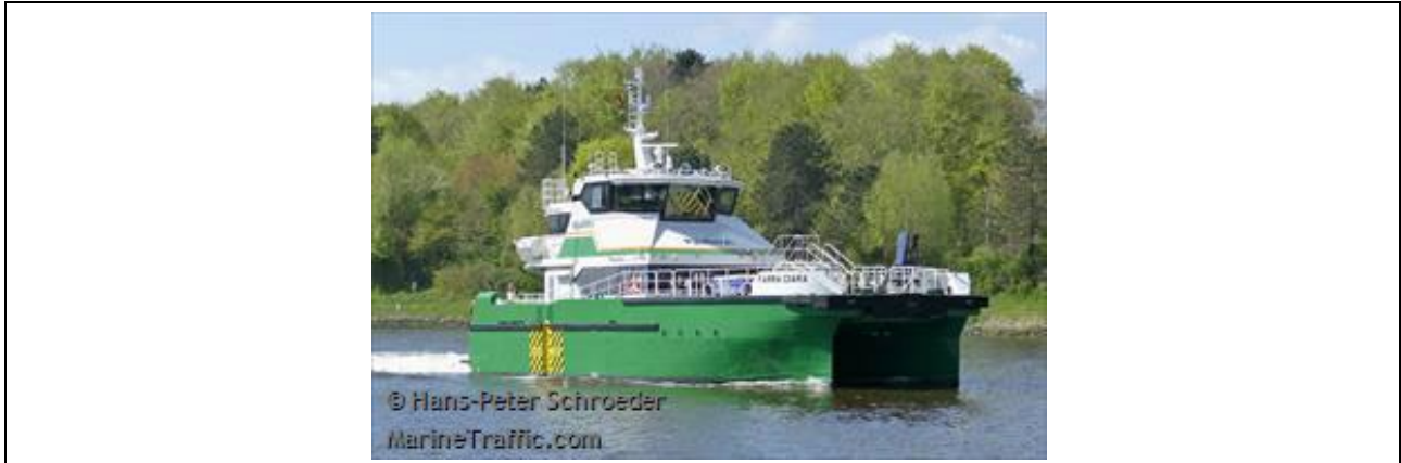
Table 9 – Windcat 19 Vessel Details