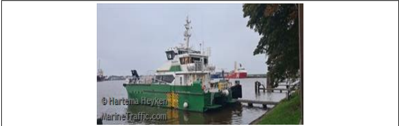
Table 4 – Manor Victor Vessel Details