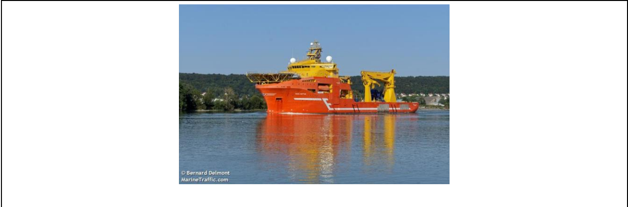
Table 4 – CF Explorer Vessel Details