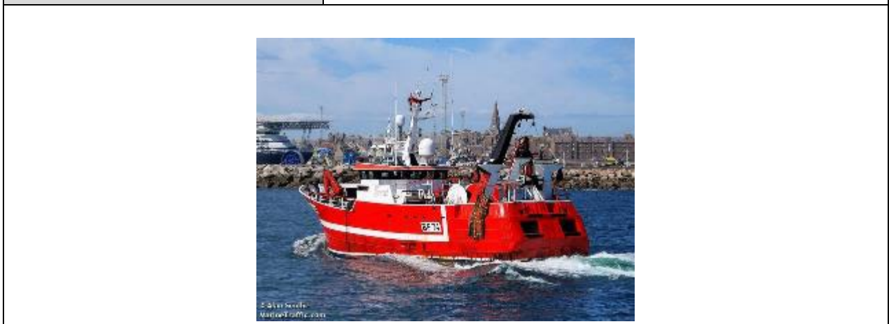
Table 4 - Tranquillity S Guard Vessel