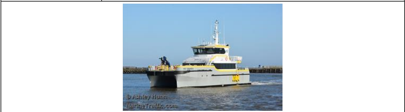
Table 3 – Farra Ciara Vessel Details