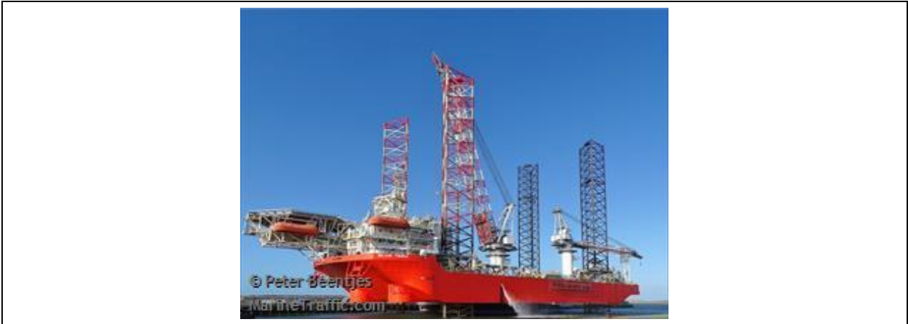
Table 3 – HST Swansea Vessel Details