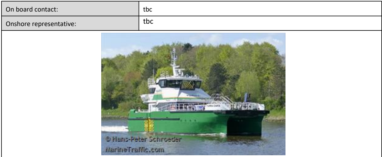
Table 4 – Mareel Sage Vessel Details