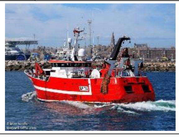
Table 6 - Tranquillity S Guard Vessel