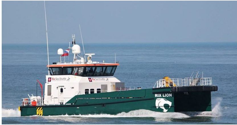
Table 4 – MMS Supreme Vessel Details