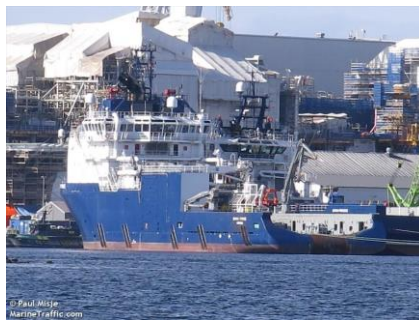
Table 6 – Rix Lion Vessel Details