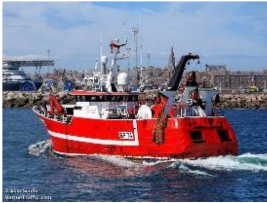
Table 8 - Tranquillity S Guard Vessel