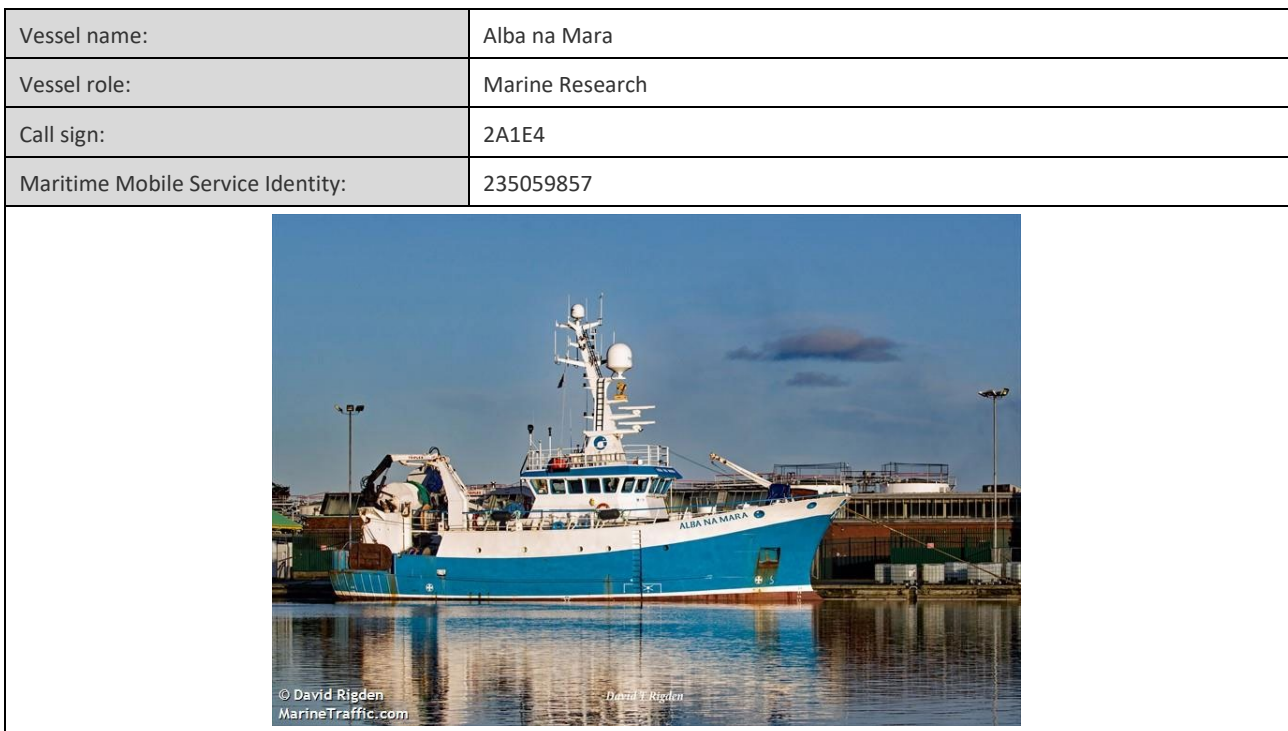
Table 2 – Alba na Mara Vessel Details

Please be aware that by virtue of its mode of operation and the equipment deployed, the Alba na Mara will at times be Restricted in Ability to Manoeuvre as defined under COLREGS (International Regulations for Preventing Collisions at Sea 1972, Rule 3). Masters of vessels are therefore requested to maintain their vessels and gears at a minimum safe distance from these vessels of 500 metres when they are undertaking it work and showing the appropriate shapes and lights.