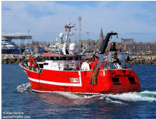
Table 4 - Tranquillity S Guard Vessel