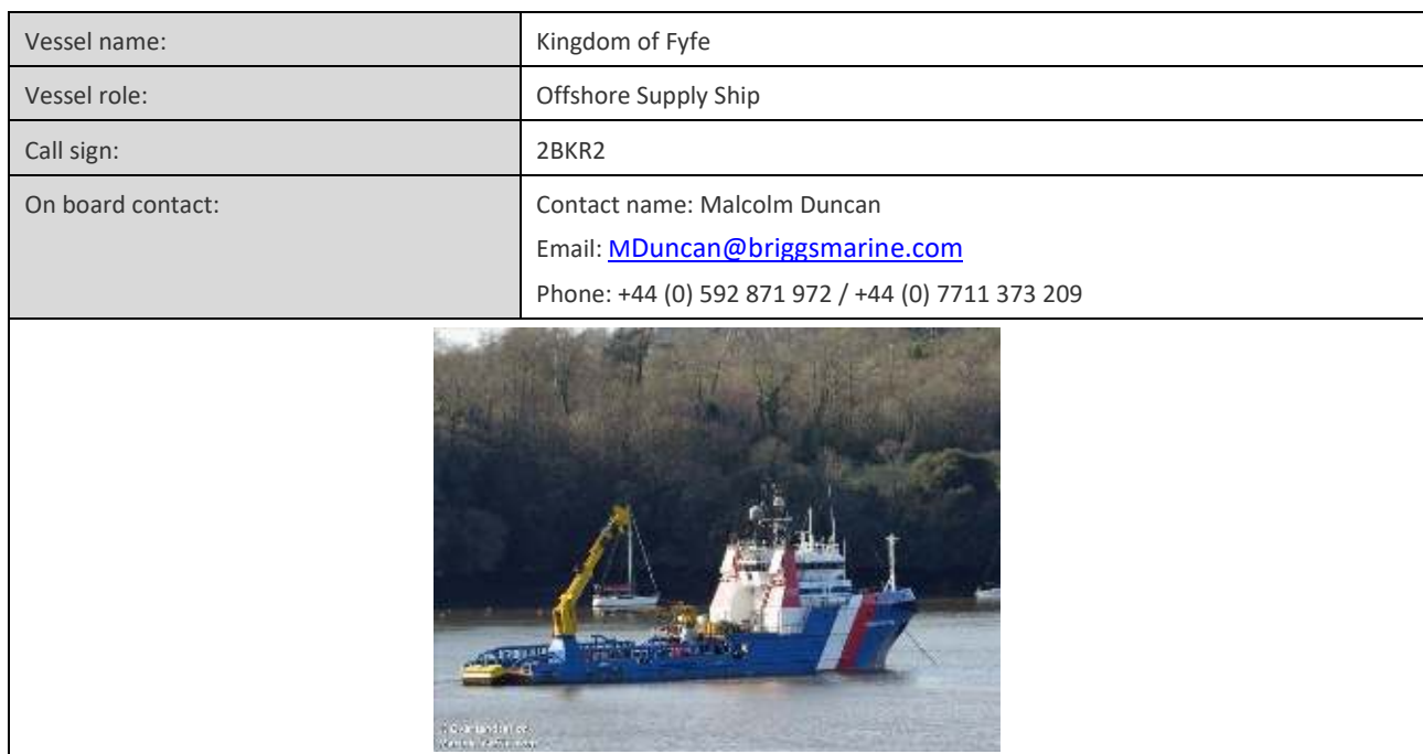
Table 2 – Kingdom of Fyfe Vessel

One guard vessel is currently within the wind farm area supporting the Neart na Gaoithe Offshore Wind Farm construction. The guard vessels will be one of the below, which can be contacted as follows, if required: