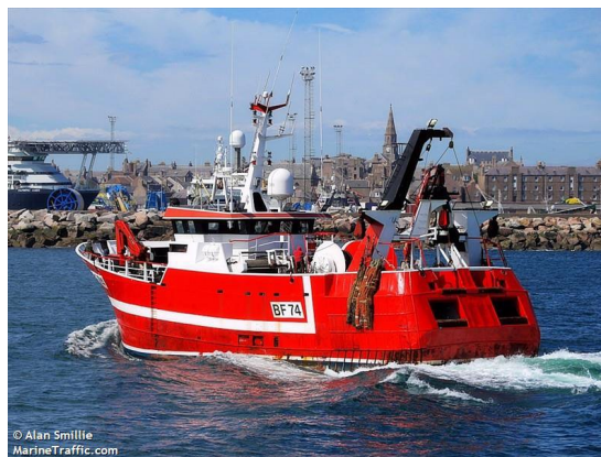
Table 3 - Tranquillity S Guard Vessel