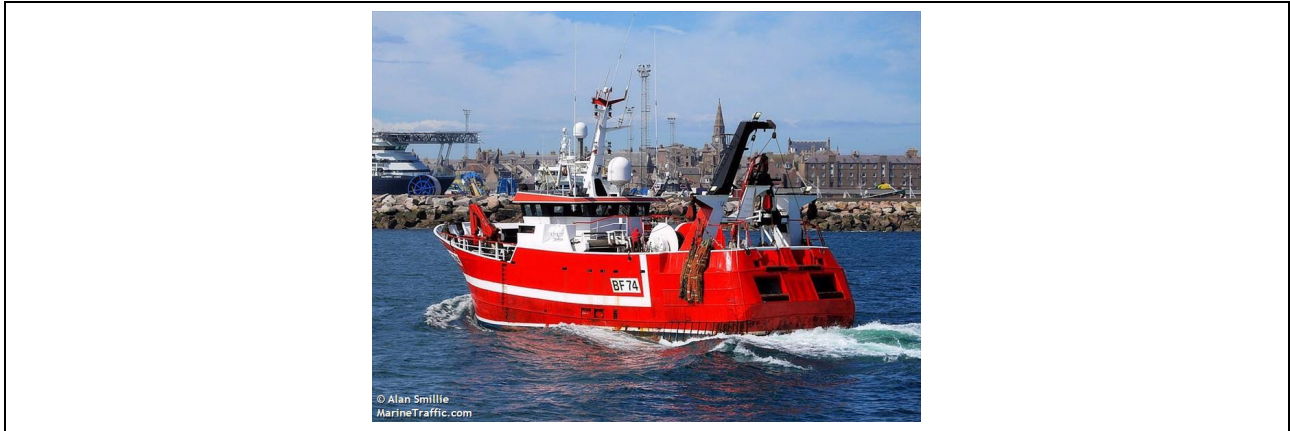
Table 4 - Tranquillity S Guard Vessel