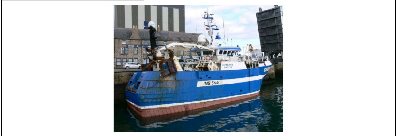
Figure 5 - Tranquillity S Guard Vessel