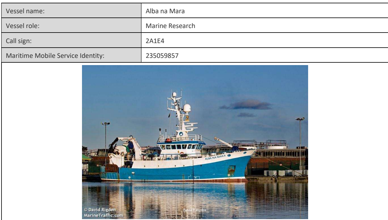
Table 2 – Alba na Mara Vessel Details

Please be aware that by virtue of its mode of operation and the equipment deployed, the Alba na Mara will at times be Restricted in Ability to Manoeuvre as defined under COLREGS (International Regulations for Preventing Collisions at Sea 1972, Rule 3). Masters of vessels are therefore requested to maintain their vessels and gears at a minimum safe distance from these vessels of 500 metres when they are undertaking it work and showing the appropriate shapes and lights.