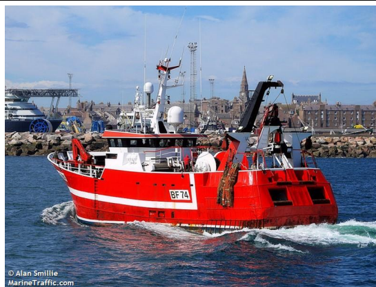
Table 5 - Artemis Guard Vessel