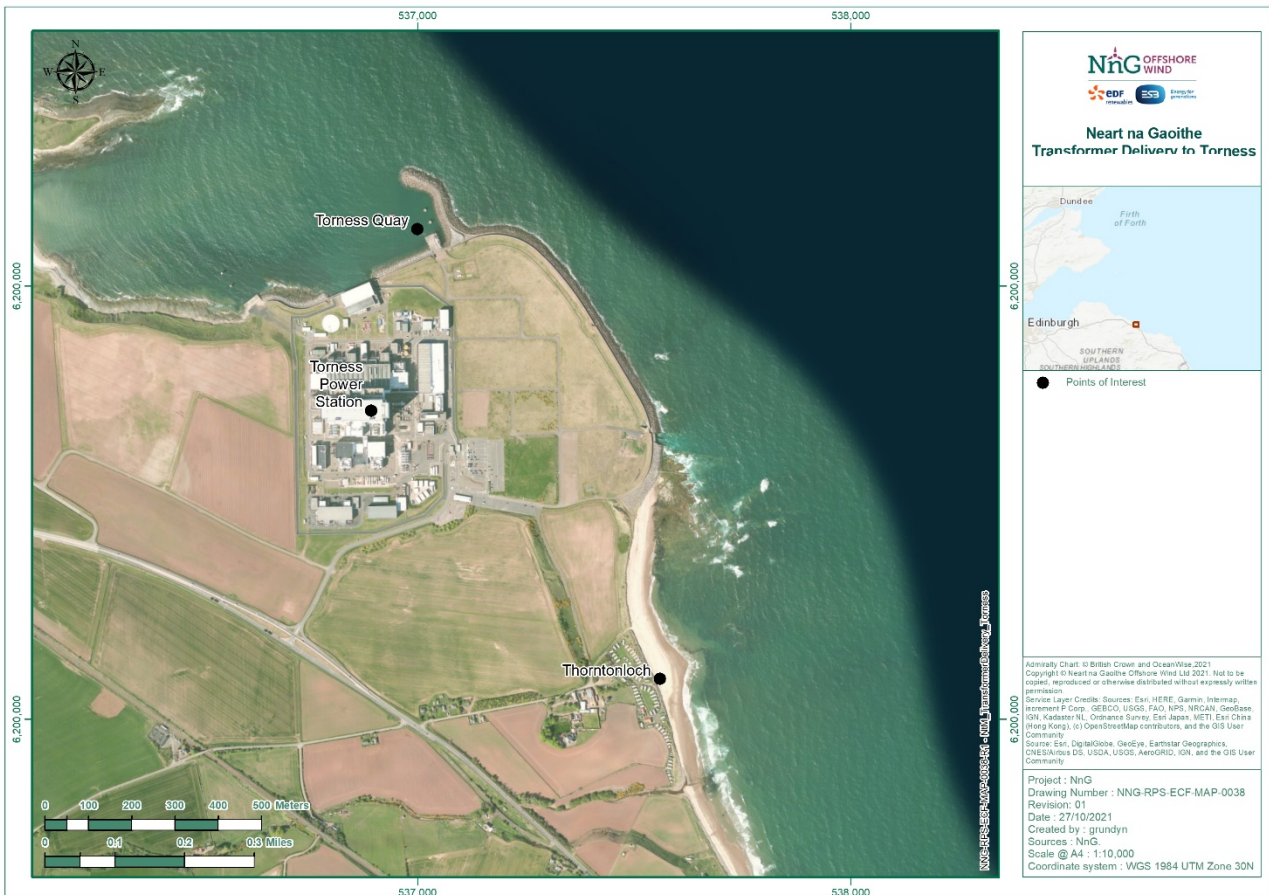
Figure 1 – Torness Quay

Mariners are advised that the Terra Marique and associated tug will arrive at the Torness Power Station quay as shown in Figure 1 and the coordinates in Table 1, from Sunderland.