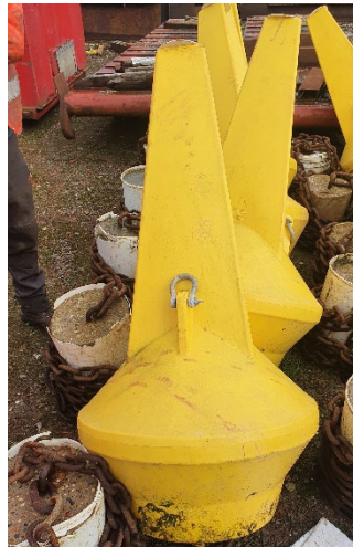
Figure 2 - SL B700 Conical Marking Buoy

The marker buoy installed is a SL B700, 1510mm in height and 700mm diameter shown in Figure 2. The buoy has an interconnected mooring attached to a clump weight and an installed lantern. The lantern is emitting a yellow light with a character of flashing once every 5 seconds at a minimum range of 2 miles.