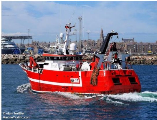
Table 3 - Artemis Guard Vessel