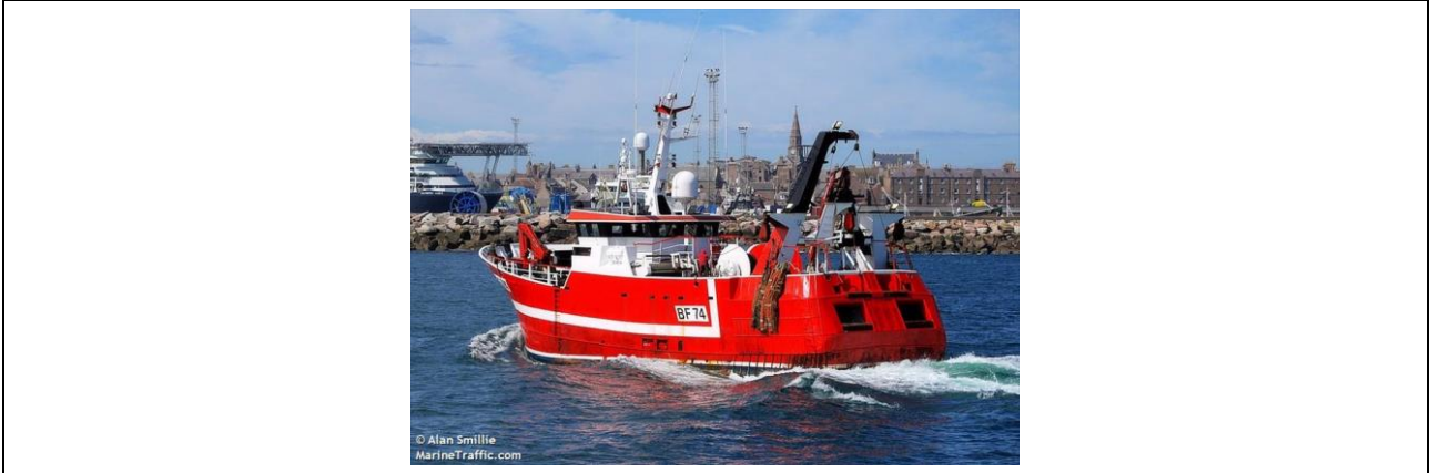
Table 4 - Artemis Guard Vessel