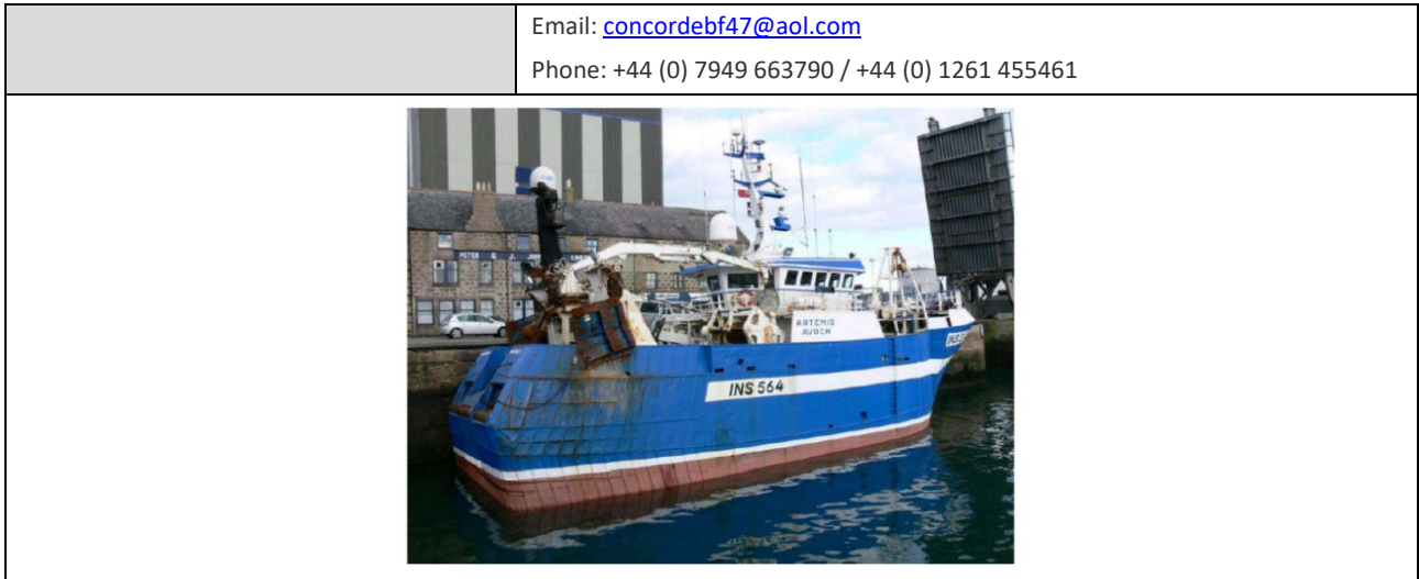
Table 5 - Tranquillity S Guard Vessel