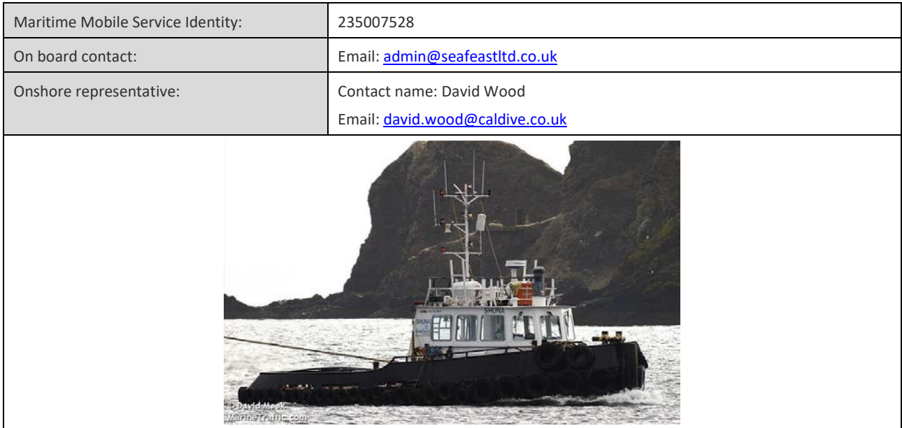
Table 4 – Isle of Jura Vessel Details