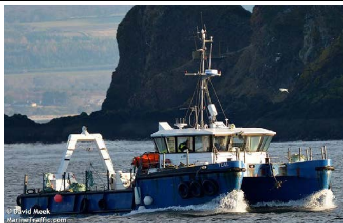
Table 3 - Shuna Vessel Details