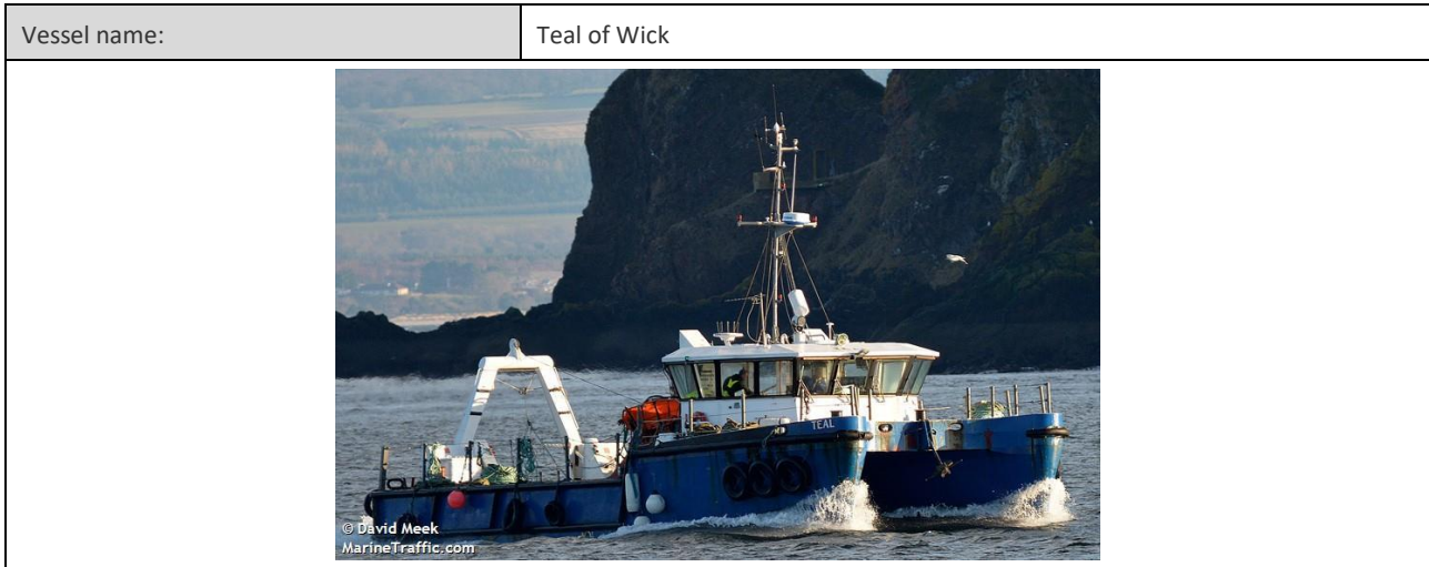
Table 3 - Shuna Vessel Details