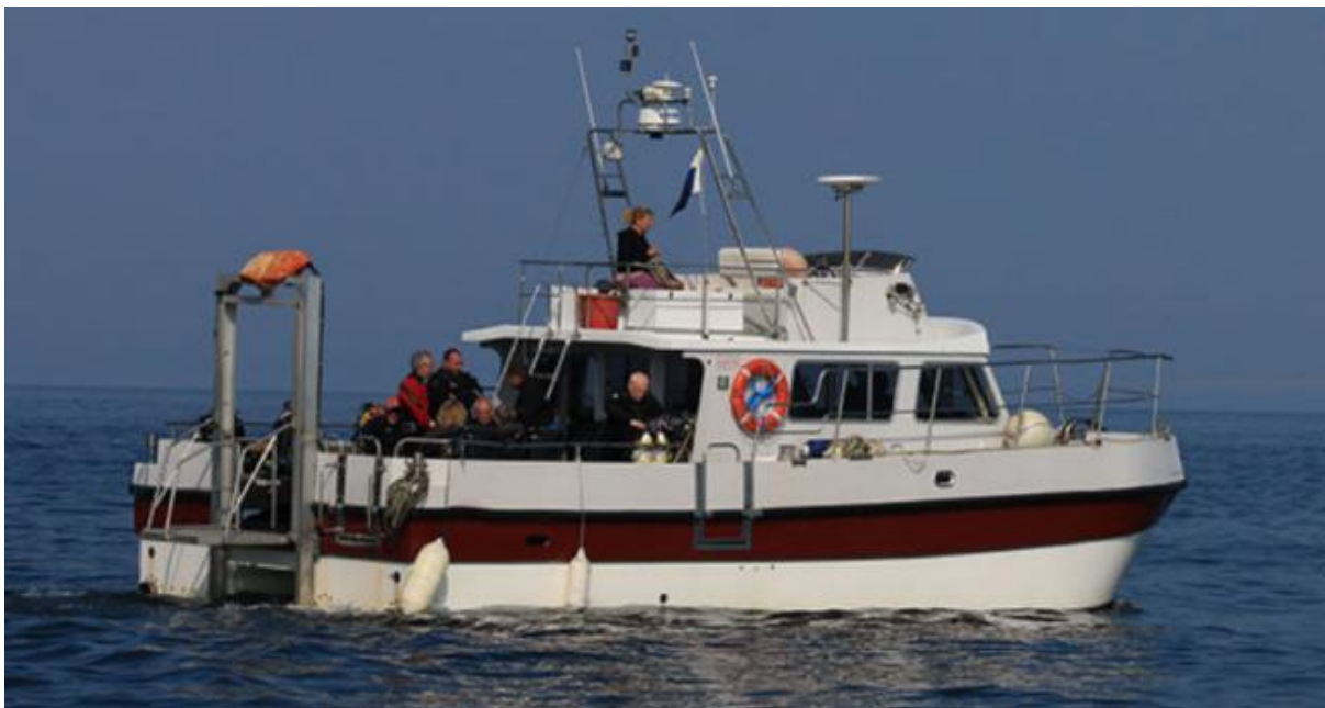
Support Vessel: Wavedancer 2