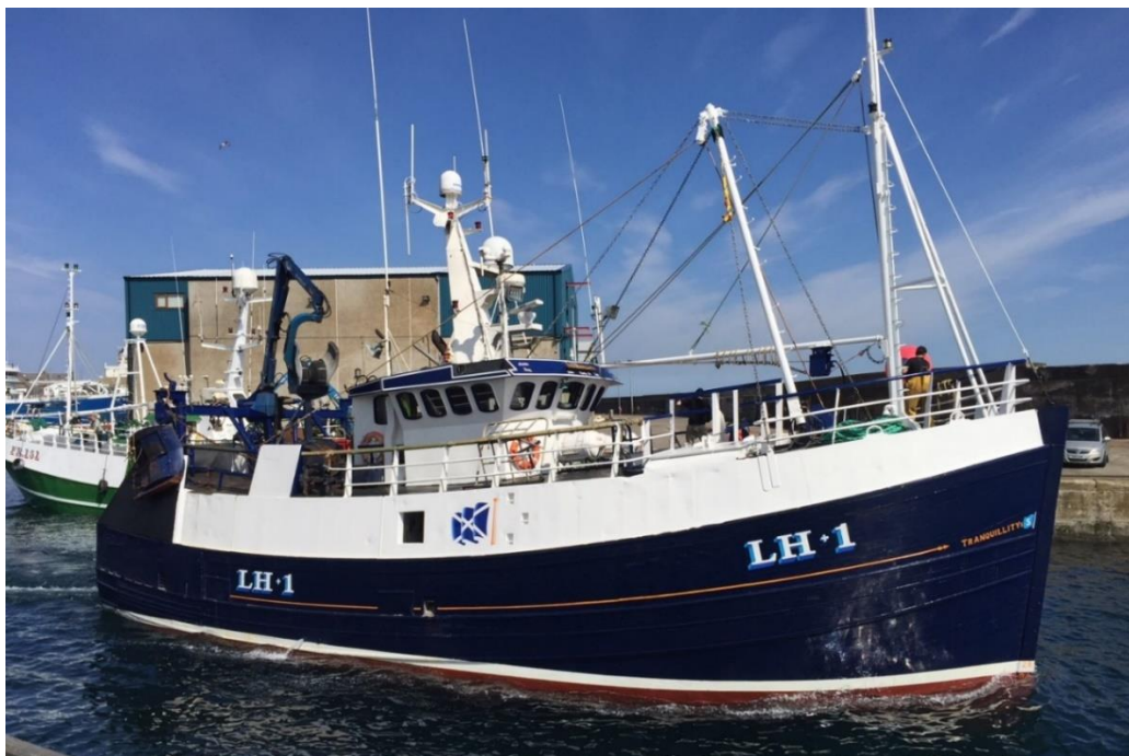
Guard Vessel: Tranquillity S