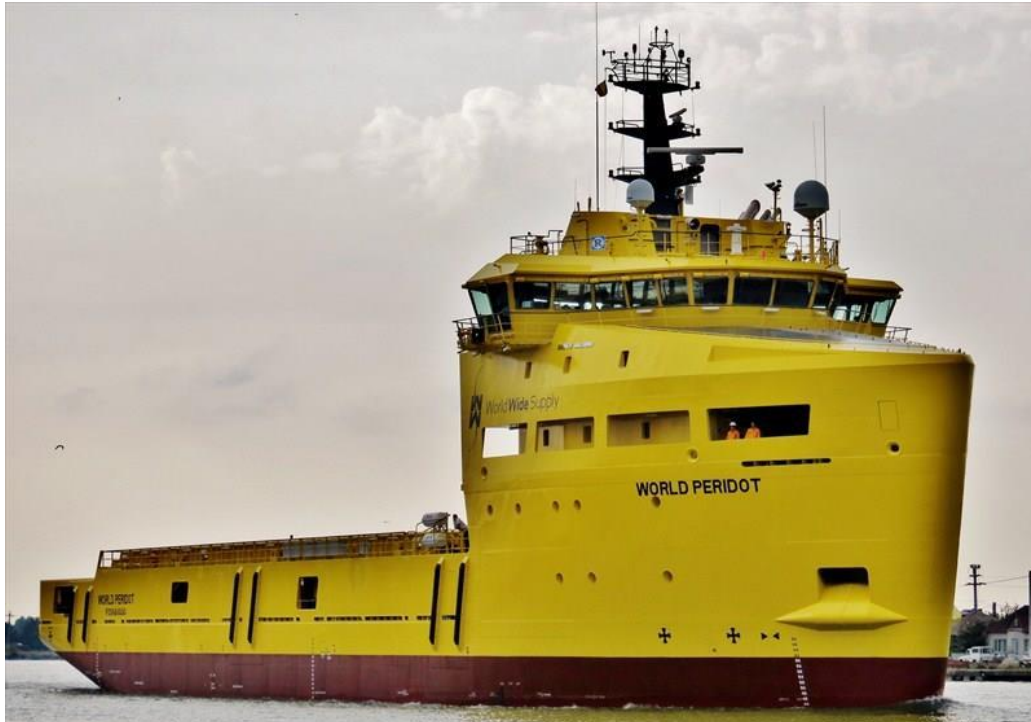
Boulder Clearance Vessel: World Peridot

The port of mobilisation is Port of Aberdeen.