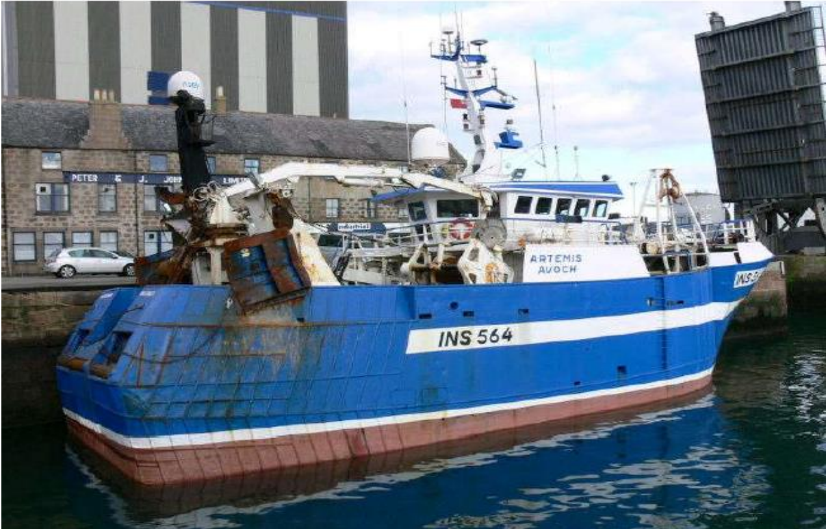
Guard Vessel: Artemis