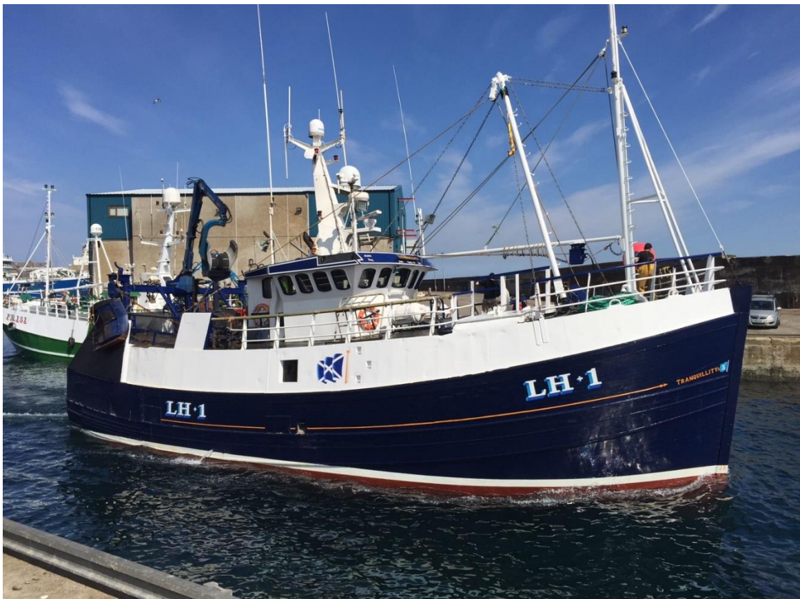
Guard Vessel: Tranquillity S