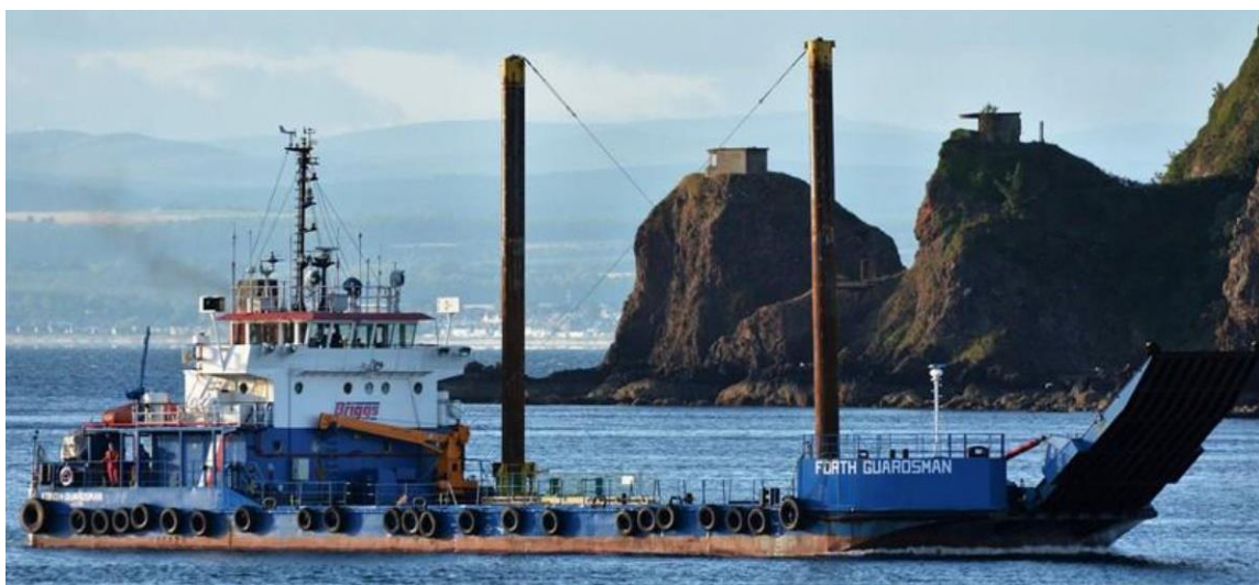
Boulder Clearance Vessel: Forth Guardsman