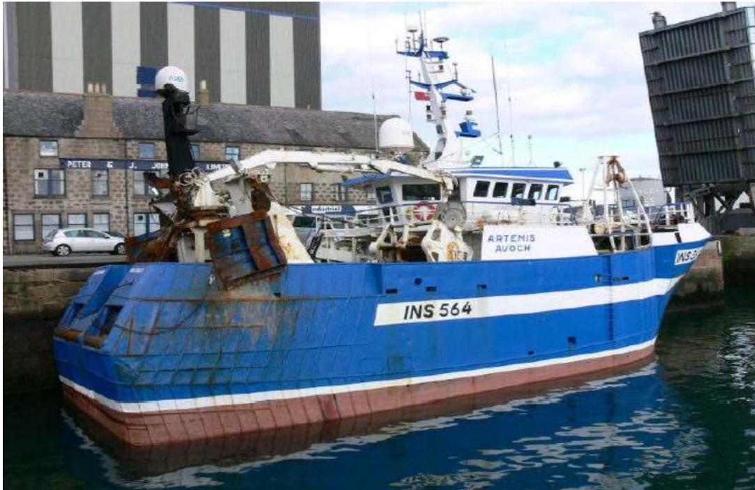
Guard Vessel: Artemis