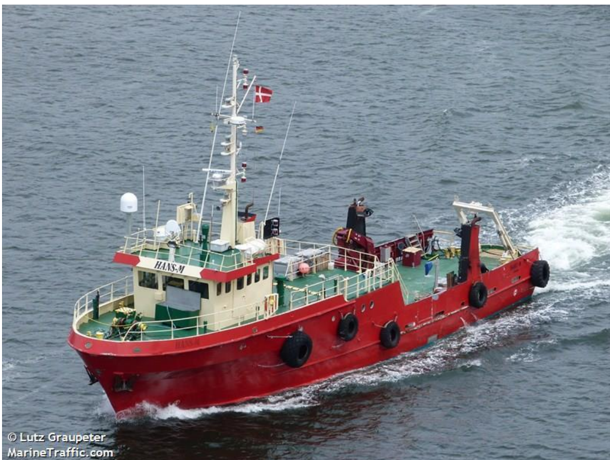
Survey Vessel: World Moon (previously Hans M )