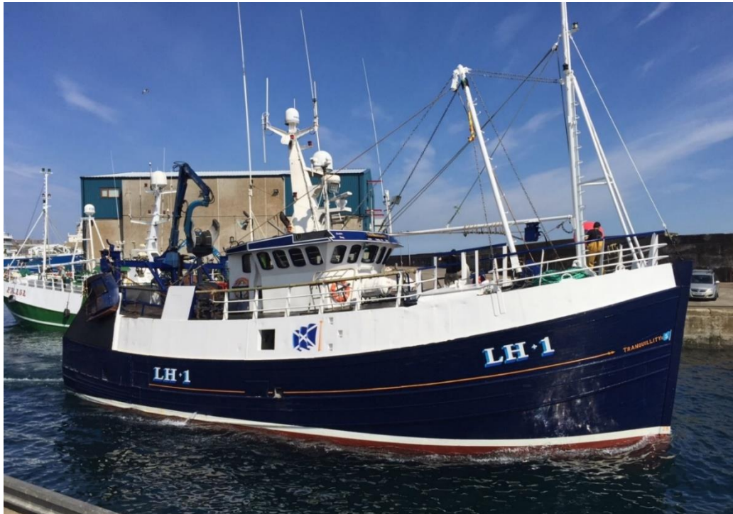
Guard Vessel: Tranquillity S