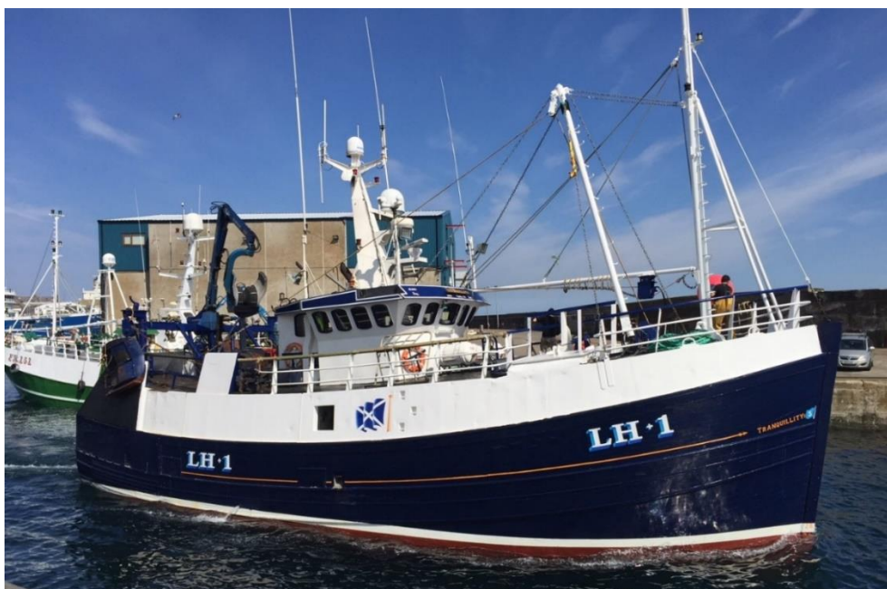
Guard Vessel: Tranquillity S

Please see Page 4 for Fisheries Liaison Officer contact details.