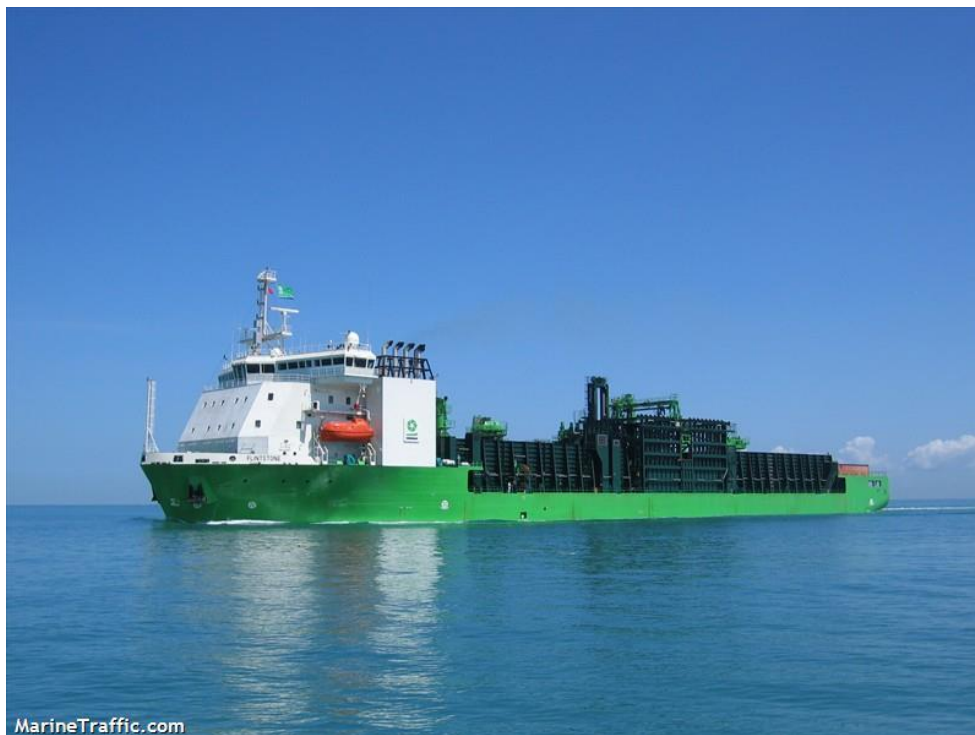
Seabed Preparation Works Vessel: Flintstone

Vessels are requested to remain 500m from the Seabed Preparation works vessel