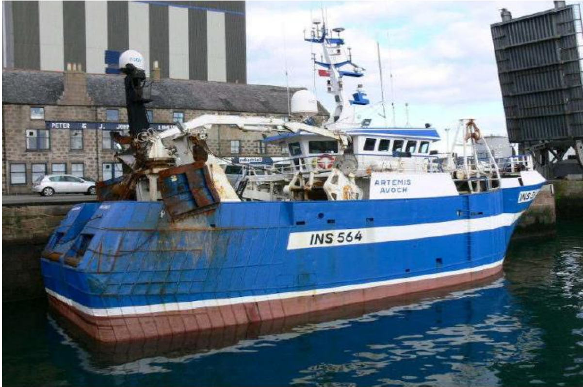
Guard Vessel: Artemis