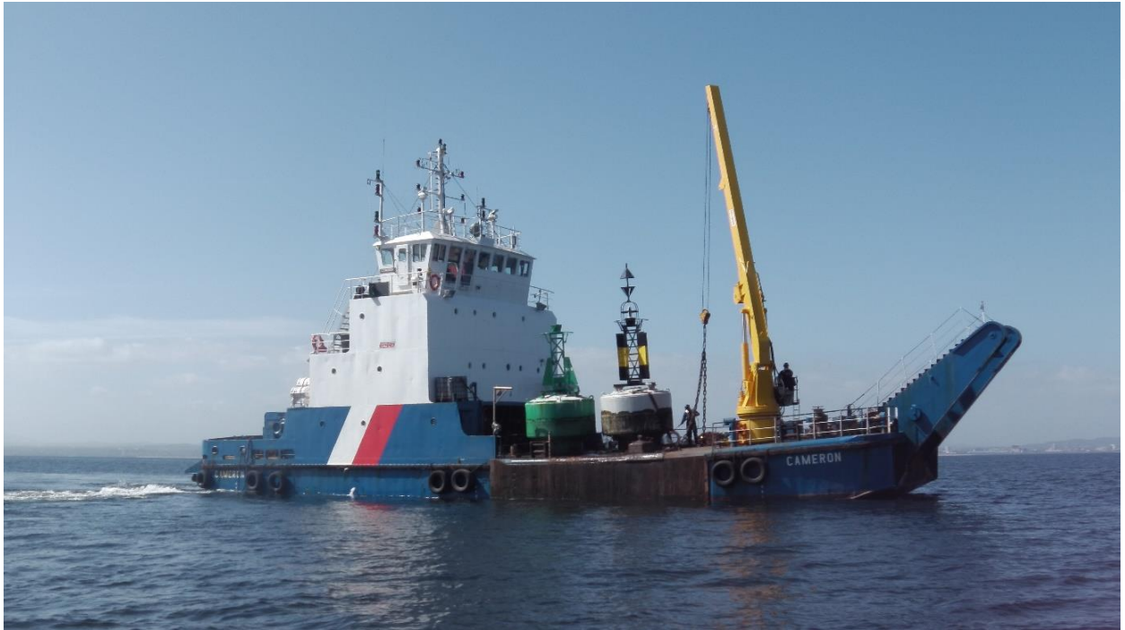
Deployment vessel: Cameron