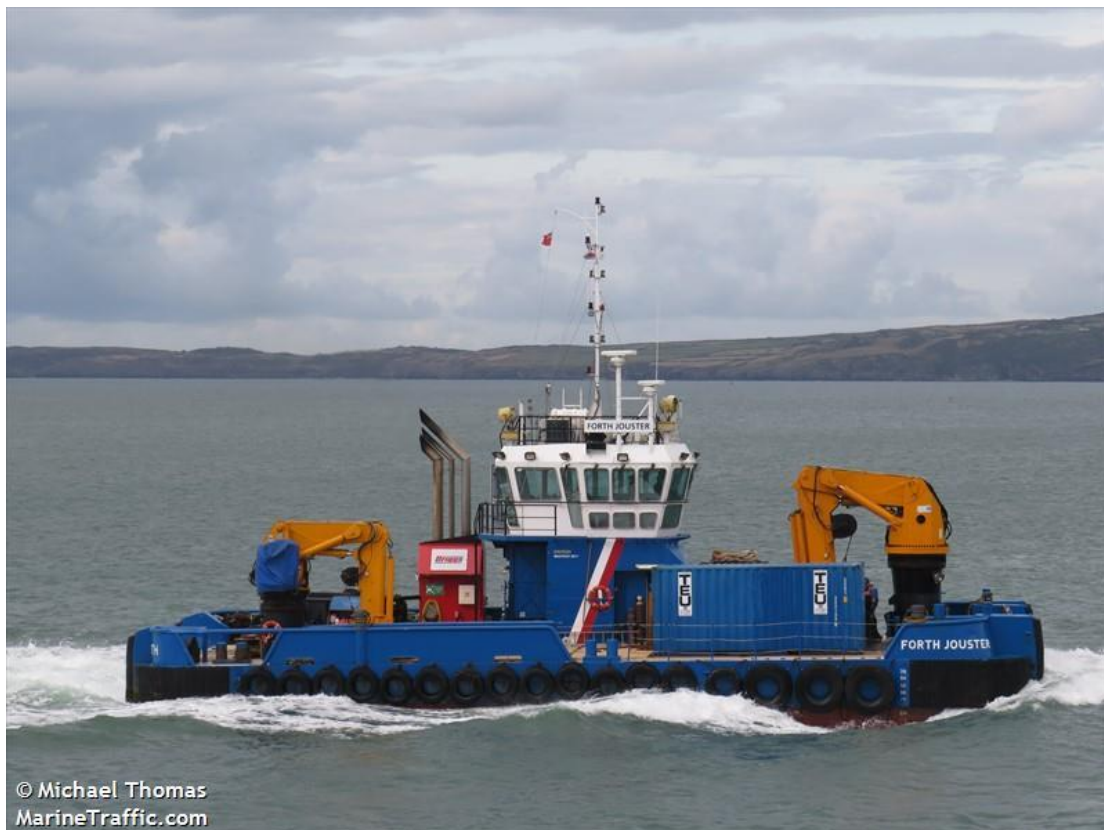
Deployment vessel: Forth Jouser

Vessels are requested to remain at least 500 metres away from the deployment vessel.