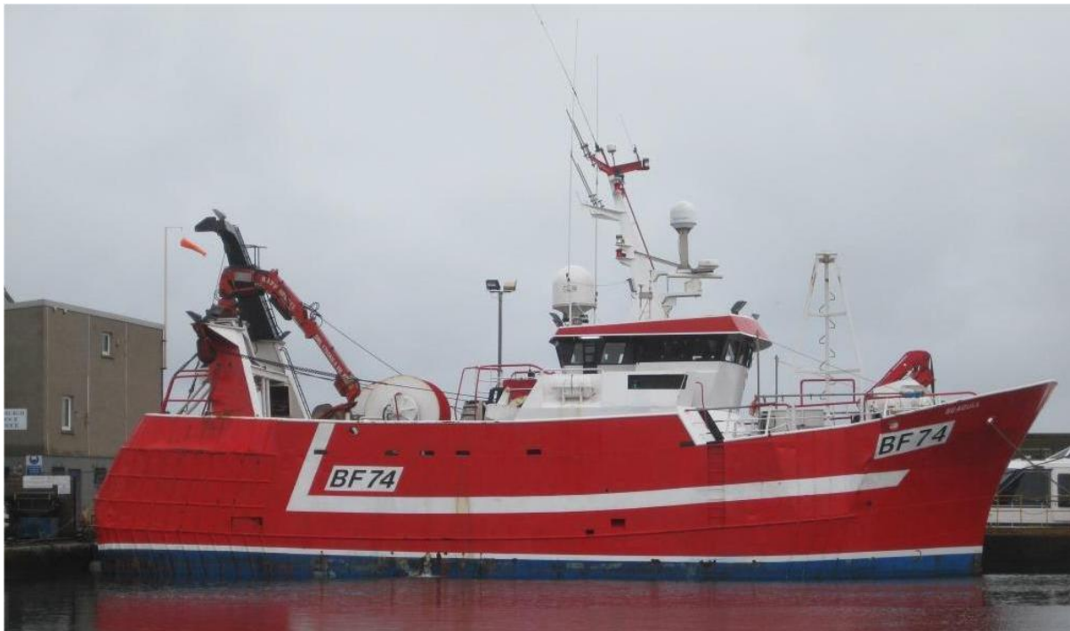
Guard Vessel: Seagull