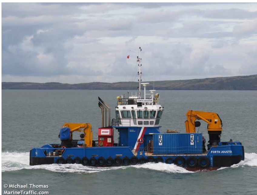
Maintenance Vessel: Forth Joster