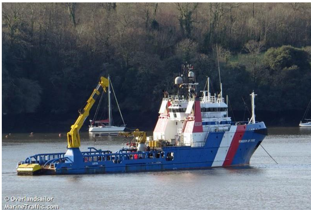
Deployment vessel: Kingdom of Fife

Vessels are requested to remain at least 500 metres away from the vessel.