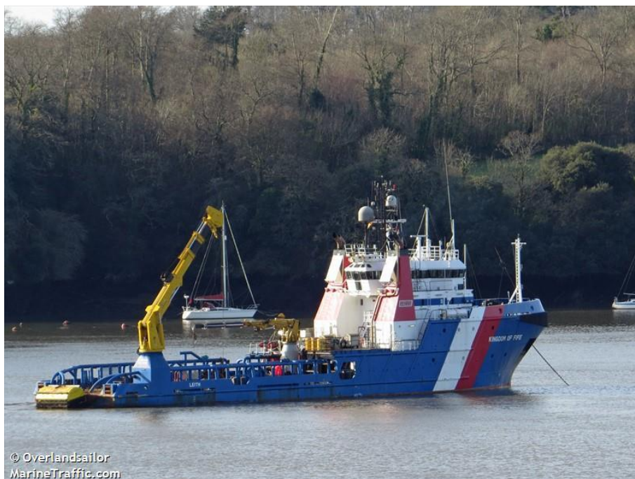
Deployment vessel: Kingdom of Fife

Vessels are requested to remain at least 500 metres away from the vessel.