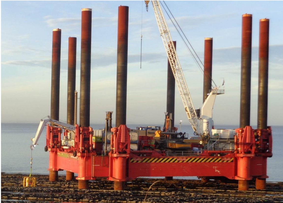
Survey Vessel: WaveWalker 1