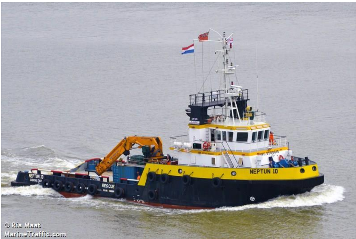
Support Vessel: (TUG) Neptun 10