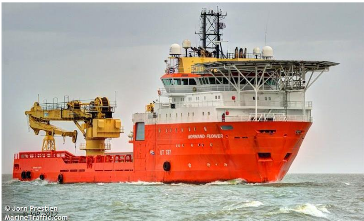
Survey Vessel: Normand Flower

Vessels are requested to remain at least 500 metres away from the survey vessels.