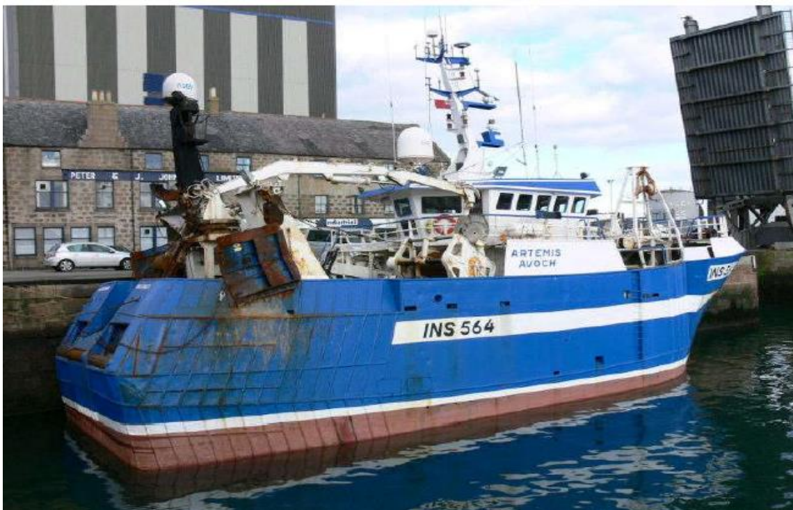
Guard Vessel: Artemis