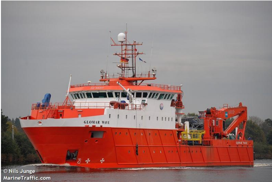
Survey Vessel: Glomar Wave