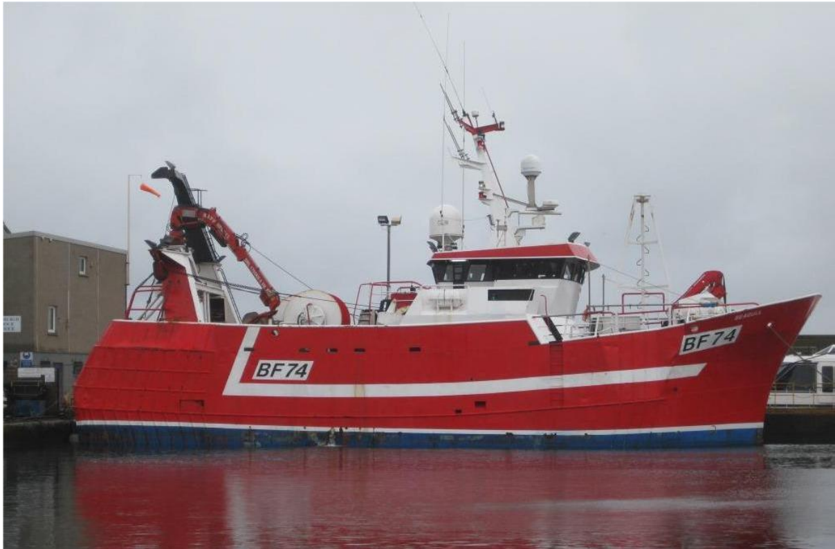
Guard Vessel: Seagull