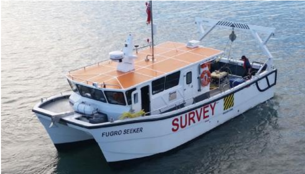
Survey Vessel: Fugro Seeker