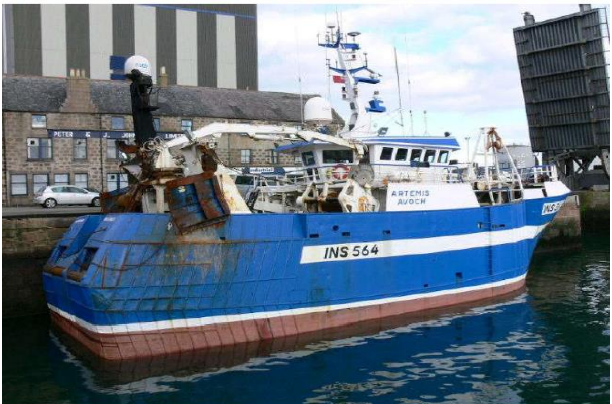
Guard Vessel: Artemis