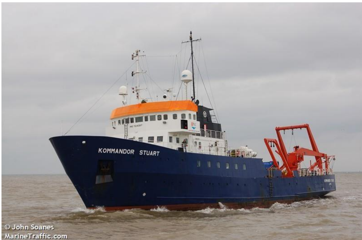
Survey Vessel: Kommandor Stuart

Vessels are requested to remain at least 500 metres away from the survey vessels.