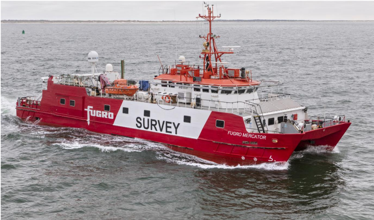
Survey Vessel: Fugro Mercator