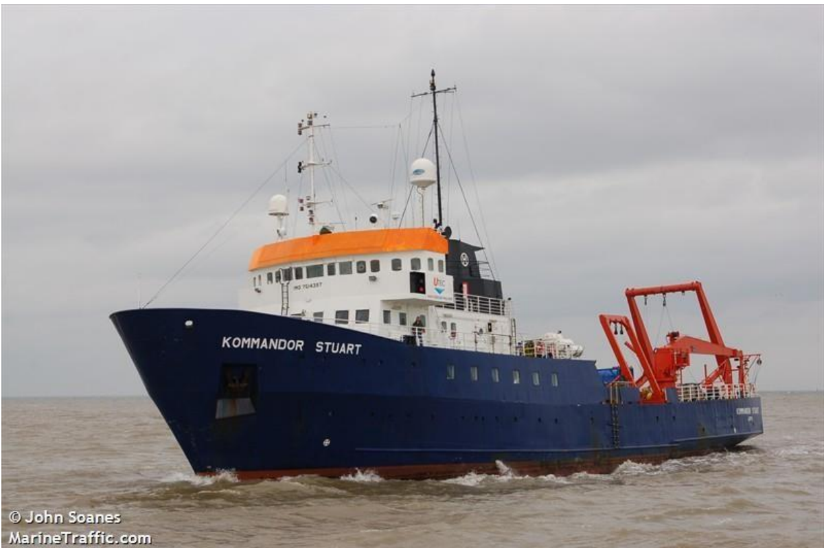
Survey Vessel: Kommandor Stuart