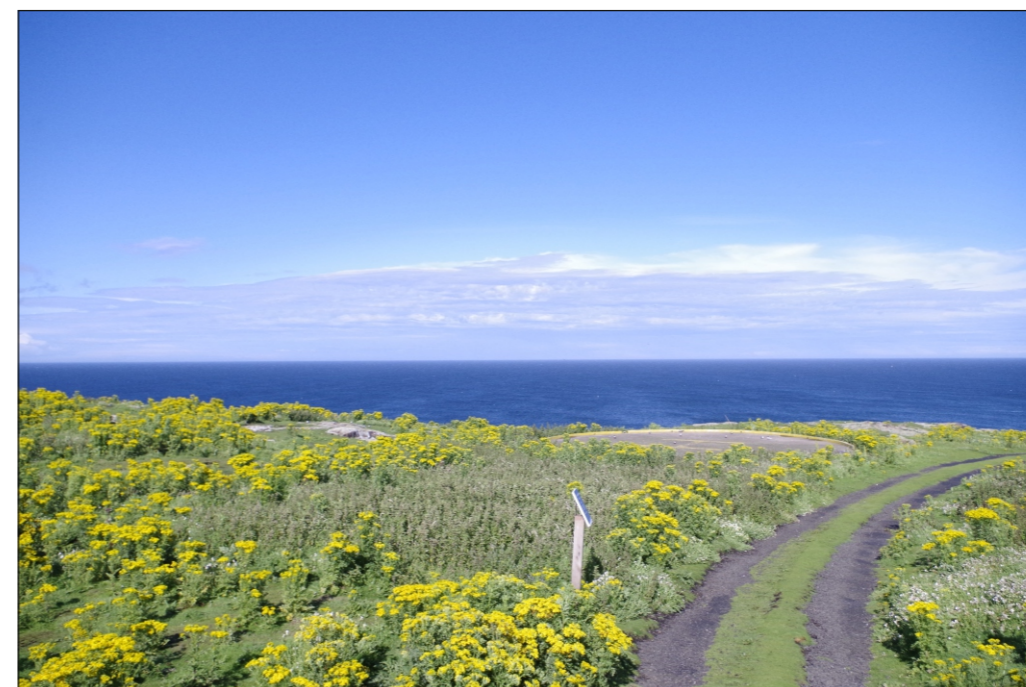
Intermediate view from Isle of May Old Lighthouse (SM887) beacon looking east towards the Offshore Wind Farm, showing the helipad

Please note, this visualisation is reproduced here for comparison purposes only. It is not to scale and does not comply with the presentation guidance in Scottish Natural Heritage's Visual Representation of Wind Farms Guidance v2.2 (2017). The original visualisations, presented in line with this guidance are available in the EIA Report Appendix 3.