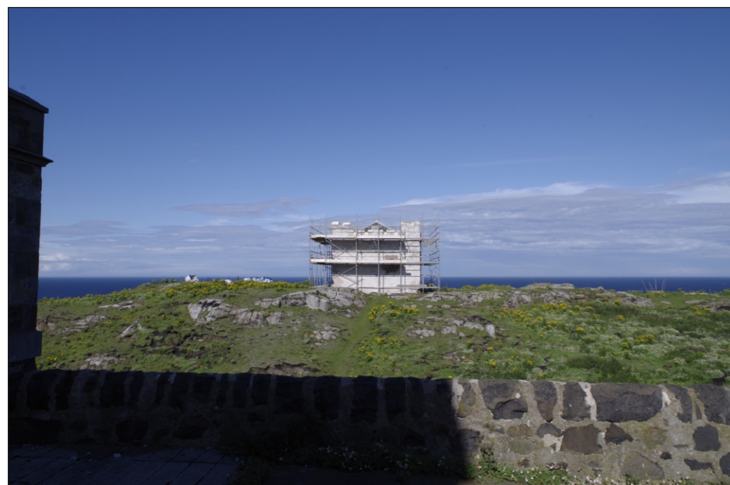
The view of Isle of May Old Lighthouse (SM887) beacon from the base of the 19th century lighthouse, facing east towards the Offshore Wind Farm

Cumulative wireline and Photomontage from Isle of May looking towards the Offshore Wind Farm