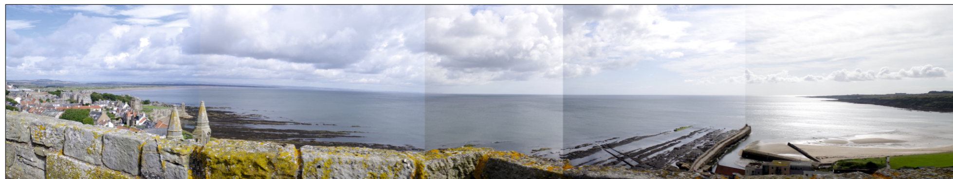
A Panorama from the top of St Rules Tower at St Andrews Castle (SM90259) looking east towards the Offshore Wind Farm

Please note, this visualisation is reproduced here for comparison purposes only. It is not to scale and does not comply with the presentation guidance in Scottish Natural Heritage's Visual Representation of Wind Farms Guidance v2.2 (2017). The original visualisations, presented in line with this guidance are available in the EIA Report Appendix 3.