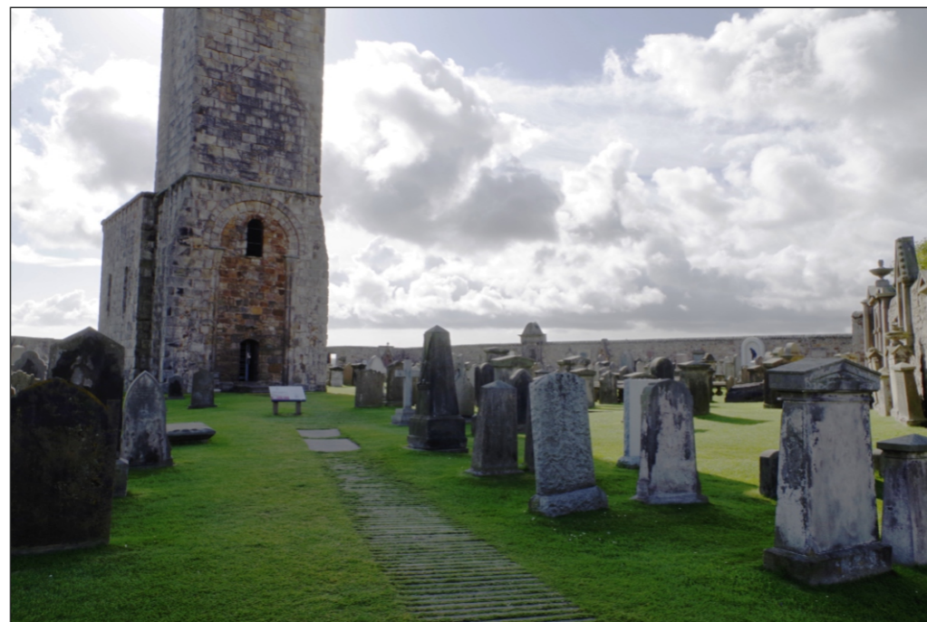
The setting of St Andrews Cathedral (SM90260) from within the grounds, showing the high wall to the east

Cumulative wireline and Photomontage from St Andrews East Scores (close to Castle and Cathedral) looking towards the Offshore Wind Farm