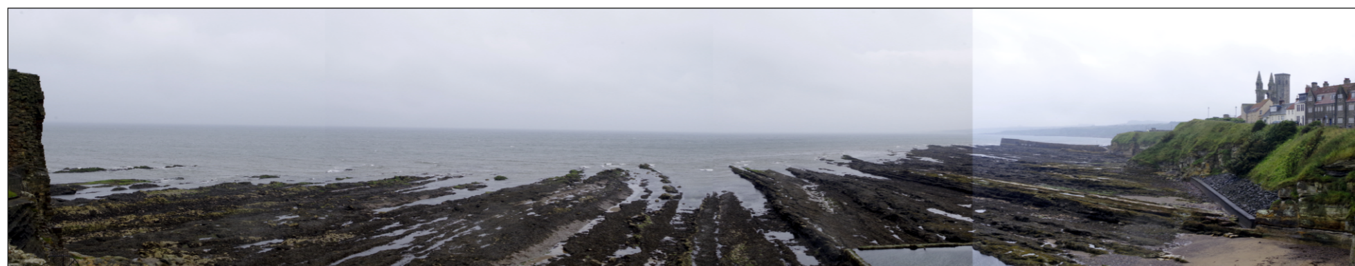
A panorama looking east towards the Offshore Wind Farm from St Andrews Castle (SM90259)

Please note, this visualisation is reproduced here for comparison purposes only. It is not to scale and does not comply with the presentation guidance in Scottish Natural Heritage's Visual Representation of Wind Farms Guidance v2.2 (2017). The original visualisations, presented in line with this guidance are available in the EIA Report Appendix 3.