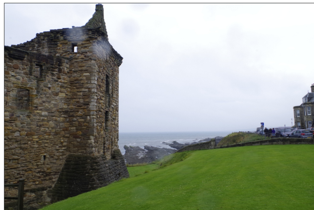
St Andrews Castle (SM90259) in its setting, facing east

Cumulative wireline and Photomontage from St Andrews East Scores (close to Castle and Cathedral) looking towards the Offshore Wind Farm