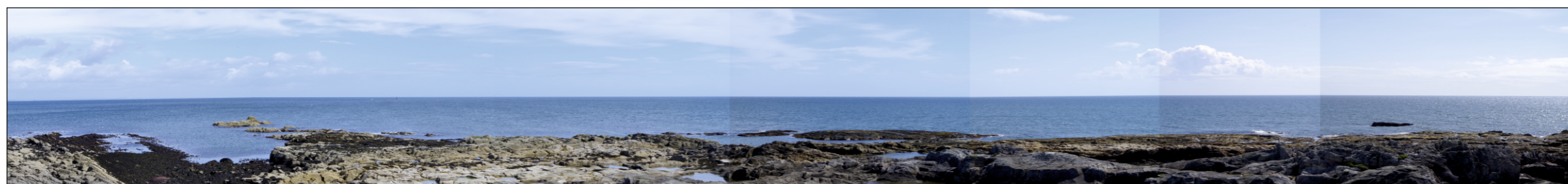
A panorama facing east towards the Offshore Wind Farm from Crail Airfield, pillbox, Foreland Head (SM6461)

Please note, this visualisation is reproduced here for comparison purposes only. It is not to scale and does not comply with the presentation guidance in Scottish Natural Heritage's Visual Representation of Wind Farms Guidance v2.2 (2017). The original visualisations, presented in line with this guidance are available in the EIA Report Appendix 3.