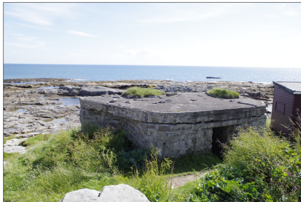
The setting of Crail Airfield, pillbox, Foreland Head (SM6461), facing east towards the Offshore Wind Farm

Cumulative wireline and Photomontage from Fife Ness (close to Crail Airfield Pillbox) looking towards the Offshore Wind Farm