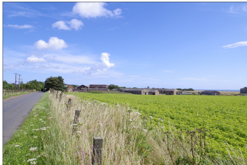
The view looking east over Crail Airfield (SM6642) towards the Offshore Wind Farm from the road

Please note, this visualisation is reproduced here for comparison purposes only. It is not to scale and does not comply with the presentation guidance in Scottish Natural Heritage's Visual Representation of Wind Farms Guidance v2.2 (2017). The original visualisations, presented in line with this guidance are available in the EIA Report Appendix 3.