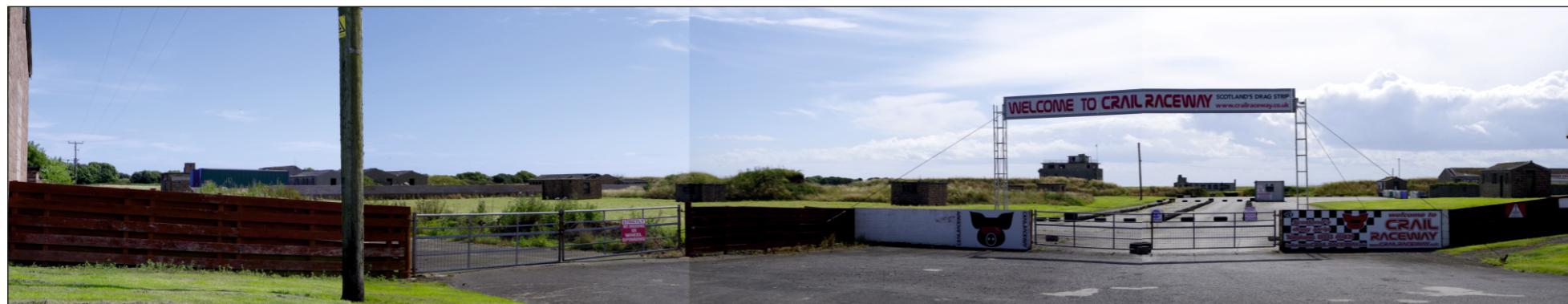
The view of the Crail Airfield (SM6642) from within facing east towards the Offshore Wind Farm