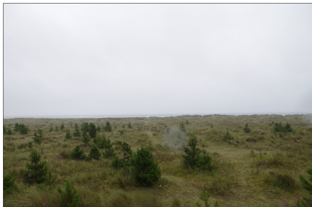
The dunes near Tentsmuir coastal defences (SM9712), facing east towards the Offshore Wind Farm

Cumulative wireline and Photomontage from Tentsmuir coastal defences looking towards the Offshore Wind Farm