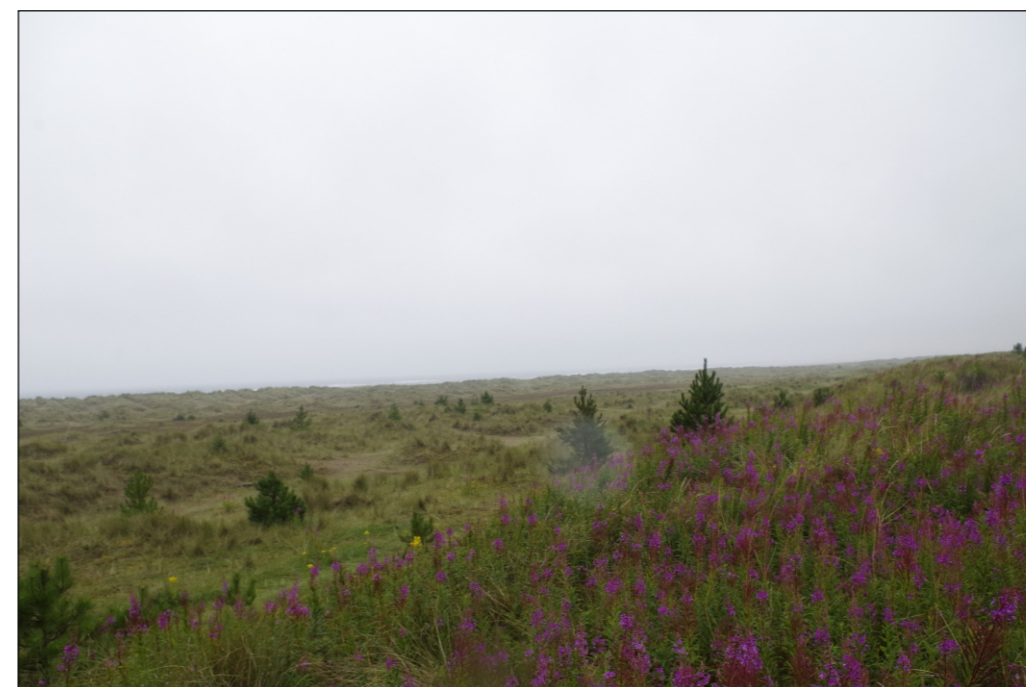
The view out to sea from near Tentsmuir coastal defences (SM9712) facing south east towards the Offshore Wind Farm

Please note, this visualisation is reproduced here for comparison purposes only. It is not to scale and does not comply with the presentation guidance in Scottish Natural Heritage's Visual Representation of Wind Farms Guidance v2.2 (2017). The original visualisations, presented in line with this guidance are available in the EIA Report Appendix 3.