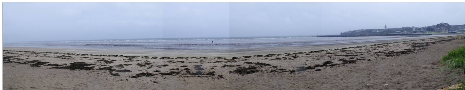
A panorama facing east towards the Offshore Wind Farm from St Andrews Links (GDL00080), with St Andrews town on the right

Please note, this visualisation is reproduced here for comparison purposes only. It is not to scale and does not comply with the presentation guidance in Scottish Natural Heritage's Visual Representation of Wind Farms Guidance v2.2 (2017). The original visualisations, presented in line with this guidance are available in the EIA Report Appendix 3.