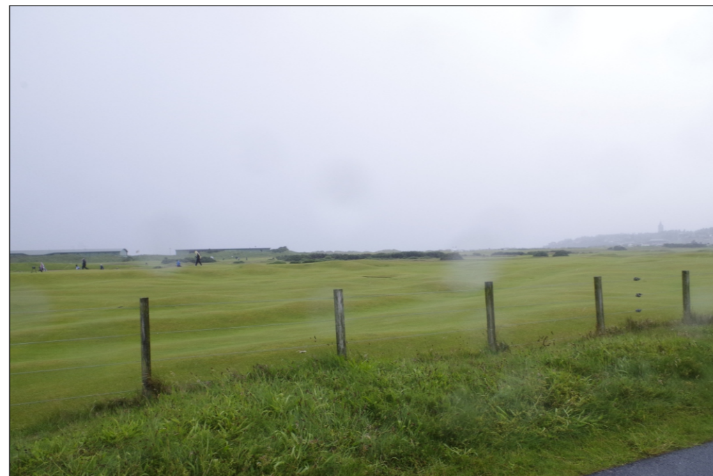
The view across St Andrews Links (GDL00080), facing east towards the Offshore Wind Farm

Cumulative wireline and Photomontage from St Andrews West Sands Road (in front of the Links) looking towards the Offshore Wind Farm