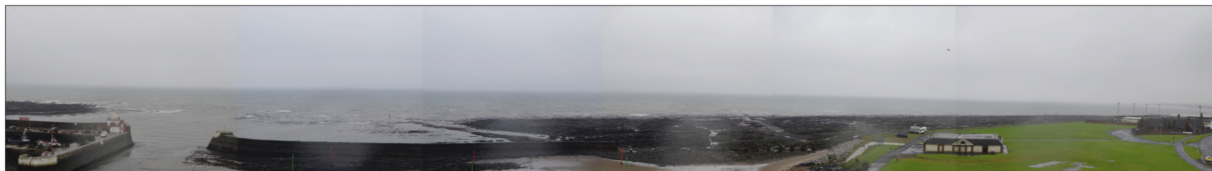
A panorama looking east towards the Offshore Wind Farm from the top of Ladyloan Signal Tower (HB21230)

Please note, this visualisation is reproduced here for comparison purposes only. It is not to scale and does not comply with the presentation guidance in Scottish Natural Heritage's Visual Representation of Wind Farms Guidance v2.2 (2017). The original visualisations, presented in line with this guidance are available in the EIA Report Appendix 3.