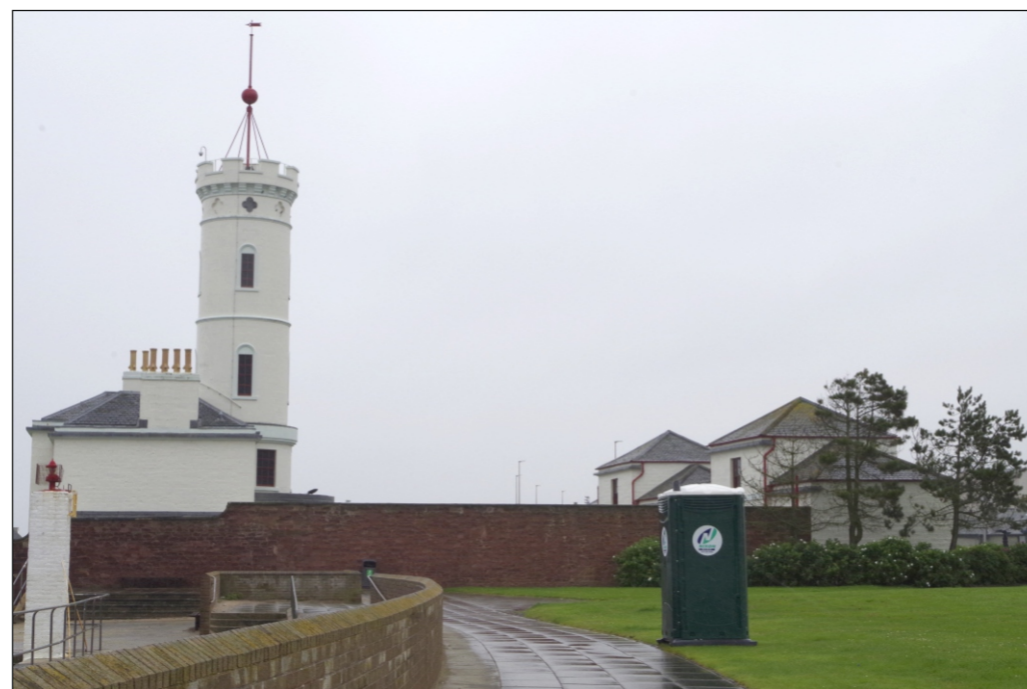
The Ladyloan Signal Tower (HB21230) at Arbroath within its setting in the town, facing south west

Cumulative wireline and Photomontage from Ladyloan Signal Tower looking towards the Offshore Wind Farm