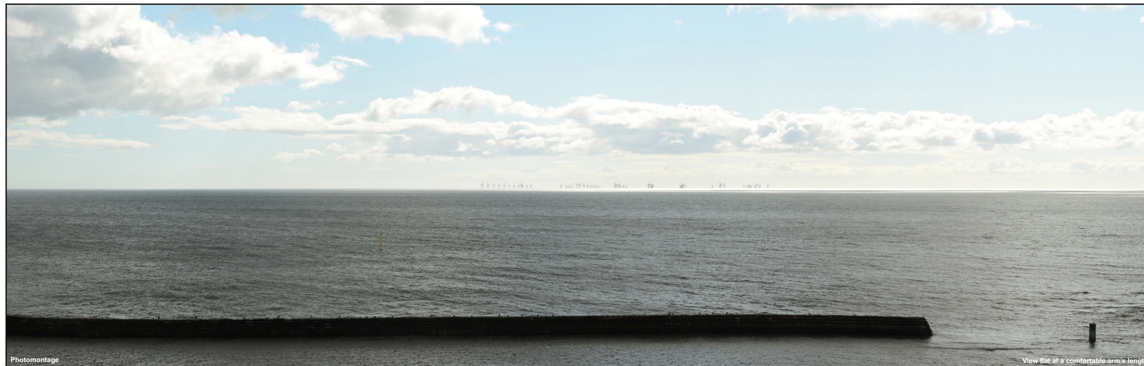
Figure: 14.21.4 Viewpoint 7: Arbroath Signal Tower

OS reference: 364047 E 740440 N AOD: 2 m Direction of view: 148° Nearest turbine: 32.1 km Horizontal field of view: 53.5° (planar projection) Principal distance: 812.5 mm Paper size: 841 x 297 mm (half A1) Correct printed image size: 820 x 260 mm Camera: Nikon D7000 Lens: Nikkor 35mm f1.8D Camera height: 1.5 m AGL Date and time: 07/09/2011 12:05