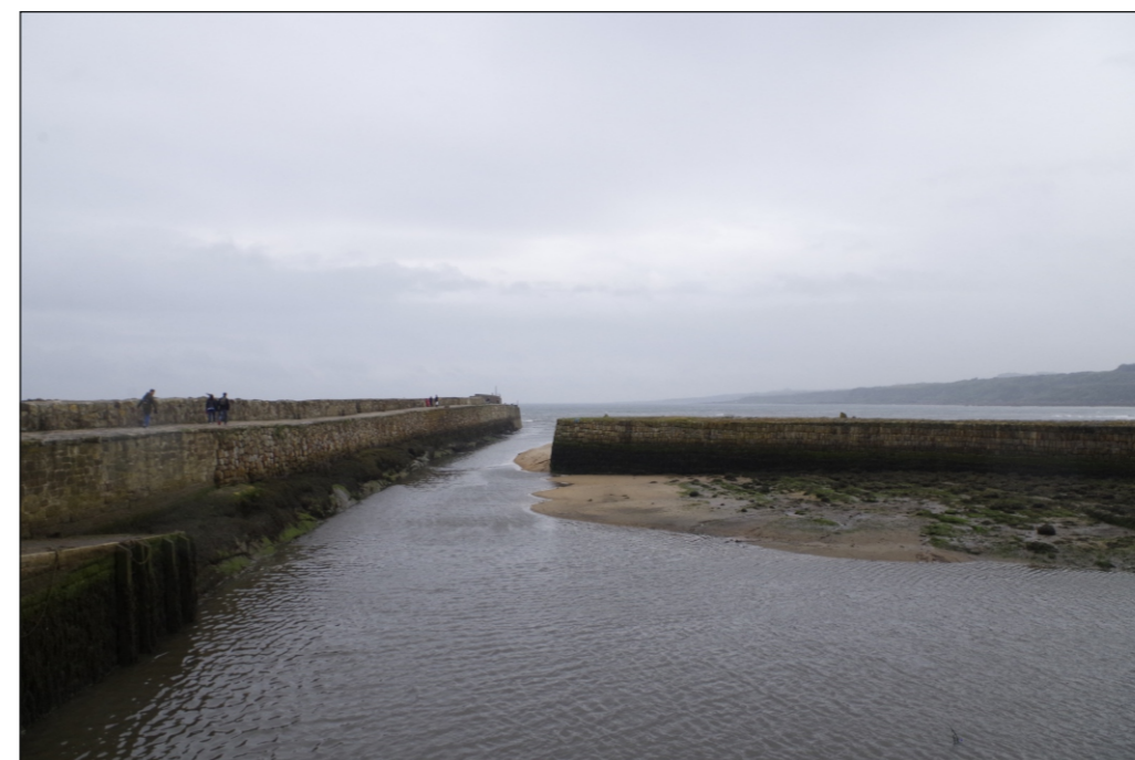
Looking east from St Andrews Harbour (HB40596) towards the Offshore Wind Farm

Please note, this visualisation is reproduced here for comparison purposes only. It is not to scale and does not comply with the presentation guidance in Scottish Natural Heritage's Visual Representation of Wind Farms Guidance v2.2 (2017). The original visualisations, presented in line with this guidance are available in the EIA Report Appendix 3.