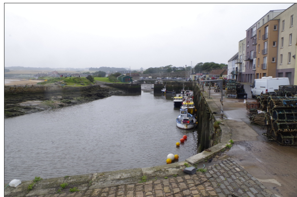
The setting of St Andrews Harbour (HB40596), facing south

Cumulative wireline and Photomontage from St Andrews East Scores (above harbour) looking towards the Offshore Wind Farm